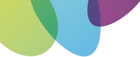
Figure 1: Patient journey stages for W&C Surgical Services